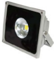
SP-FL-004A / SP-FL-005A